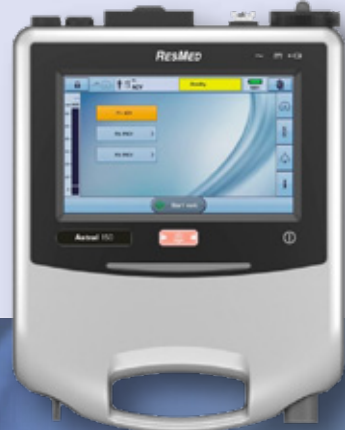
ResMed Astral 150

The Edge COVID-19 Equipment Fund donated 35 ResMed Astral 150 ventilators to the Malaysian Relief Agency. These and hundreds more were tirelessly installed throughout the country by our local distributor Insan Bakti , who was given the COVID-19 HERO Award in November 2020 by ResMed Malaysia .